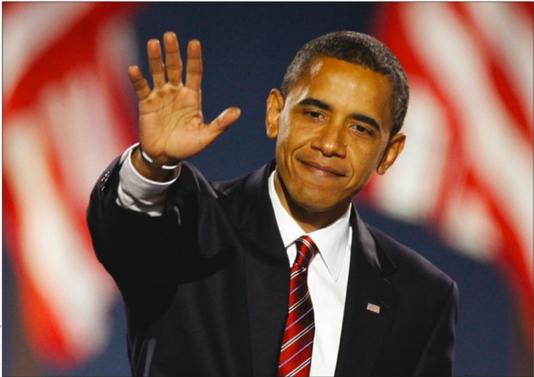
President-Elect Obama might struggle to implement his health-care campaign promises